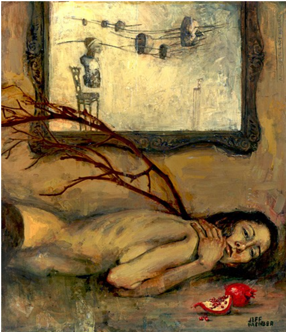
Jeff Faerber: Now at last gained ascendancy